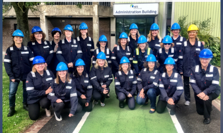
AES Site Tour of Belfast Kilroot Power Station - June 2016